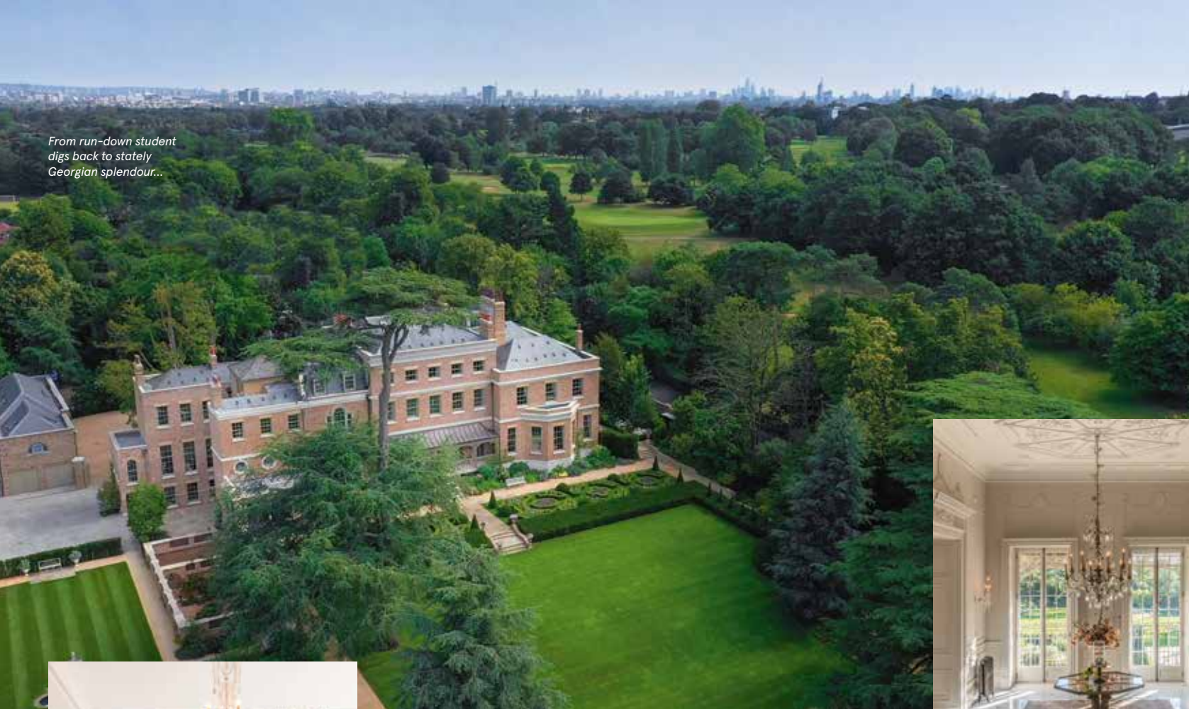
From run-down student digs back to stately Georgian splendour...