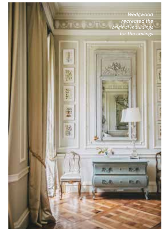
Wedgwood recreated the original mouldings for the ceilings

Landscape architect and historian Todd Longstaffe-Gowan was brought in to landscape the grounds, which are set within more than 1.2 hectares. "Templeton is exceptional in many regards, but principally on account of its rarity: few 18th-century London mansions are fortunate enough to possess as much of their original pleasure grounds," he says. The result of Longstaffe-Gowan's work