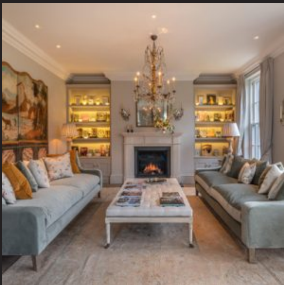
The elegant interior of Holford House by Richstone Properties

Possibly one of the prettiest houses to be built in Roedean Crescent in the last decade, Holford House is a home of classical proportions boasting a white stucco exterior, 12 panel sash windows, elegant portico entrance and artisan wrought iron railings, as well as remote controlled entrance gates.