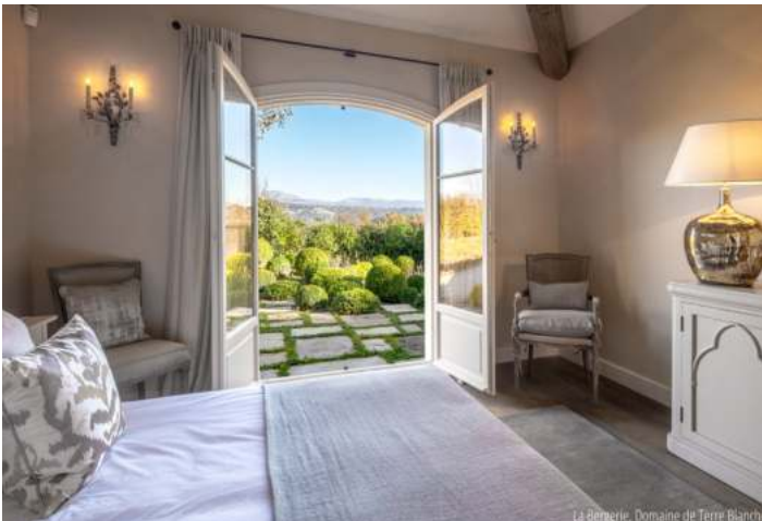
La Bergerie, Domaine de Terre Blanche