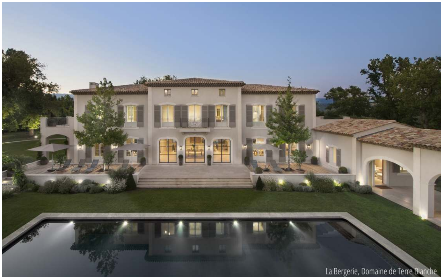
La Bergerie, Domaine de Terre Blanche